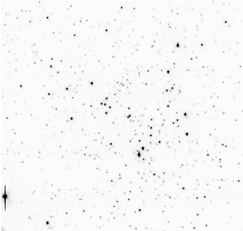
Figure 2. 6' \times 6' field towards NGC 6819 in R band.

NGC 6819 and NGC 7789 whenever both clusters were visible, and took repeated exposures on a single position when only one of these clusters was accessible. Table 1 gives an overview of the amount of images obtained in this way. Most of the data were taken in photometric conditions. The longitude difference between La Palma and Lick Observatory resulted in fairly good time coverage during the two simultaneous campaigns; an example is given in Figure 1.